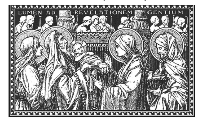
THE BLESSING OF THE CANDLES Before the Procession, the Priest, vested in a violet cope, blesses the candles, which are placed near the altar.

V. Dominus vobiscum. R. Et cum spiritu tuo.