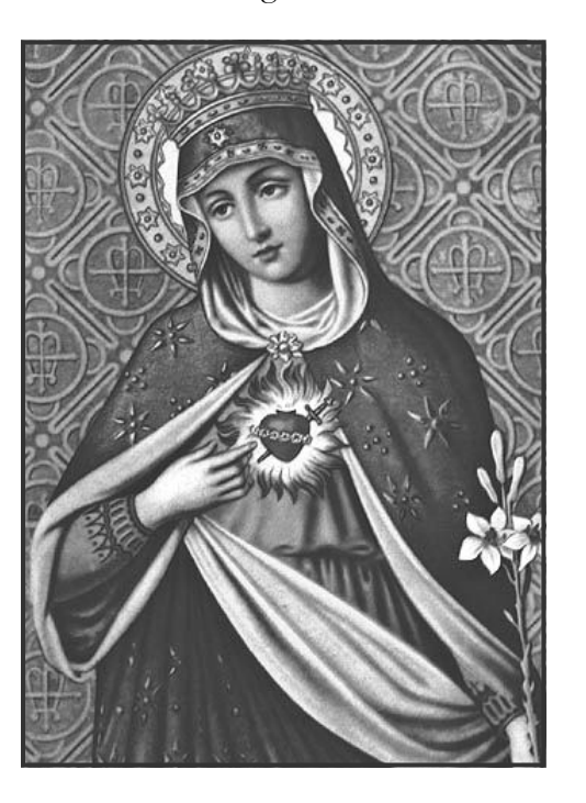
Hebrews 4, 16

ADEÁMUS cum fidúcia ad thronum grátiæ, ut misericórdiam consequámur, et grátiam inveniámus in auxílio opportuno. Ps. 44. 2. Eructávit cor meum verbum bonum: dico ego ópera mea Regi. V. Gloria Patri.