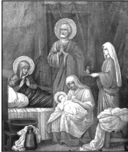
The Birth of the Virgin Mary

Ss Anna and Joachim, the Blessed Virgin and servants.