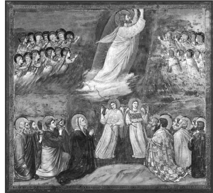
The Ascension of Our Lord, by Giotto, c. 1305, Arena Chapel.