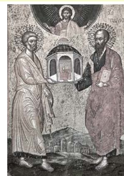
Icon with the Apostles Peter and Paul and a church effigy. Product of a northern Greek workshop. Circa 1700.

For I am already on the point of being sacrificed; the time of my departure has come. I have fought the good fight, I have finished the race, I have kept the faith. Henceforth there is laid up for me the crown of righteousness, which the Lord, the righteous judge, will award to me on that Day, and not only to me but also to all who have loved his appearing.