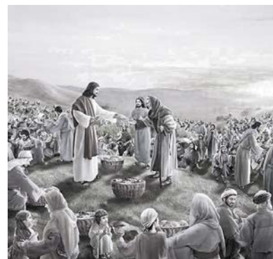
Jesus feeds the five thousand

There will be no altar server practices tomorrow (March 11, Monday).