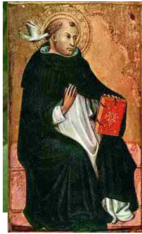
ST. THOMAS AQUINAS, THE ANGELIC DOCTOR

THE PRINCIPAL AIM OF THE CENTRE FOR THOMISTIC STUDIES, INC. IS TO PRODUCE PEOPLE WHO ARE WELL GROUNDED IN THE TRUTHS OF THE CATHOLIC FAITH. IT DOES THIS BY MAKING AVAILABLE TO EVERYONE THE PHILOSOPHICAL AND THEOLOGICAL RICHES OF ST THOMAS AQUINAS AND THE THOMISTIC TRADITION. ST THOMAS IS A GREAT TEACHER FOR THREE REASONS: