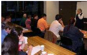
STUDENTS AT C.T.S.

There is another and higher way to know about God. That is from what God has revealed about the divine reality. This is Sacred Theology, which proceeds from principles believed, not seen.