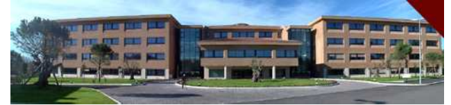
PONTIFICAL UNIVERSITY REGINA APOSTOLORUM, ROME.

Yes. The CTS has an academic agreement with the Higher Institute of Religious Studies attached to the Athenaeum Regina Apostolorum in Rome whereby students may enrol in degree courses in Theology. Details of these courses may be obtained on enquiry from the centre.